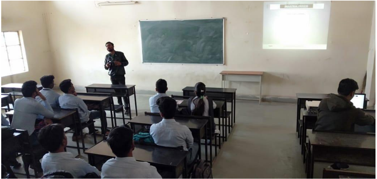
Event 34. Photo of Seminar on product and Mould design with the help of CAD/CAM & CNC Machine Technology